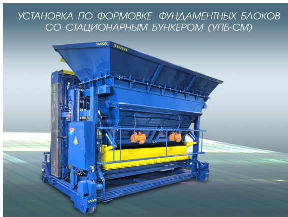
УСТАНОВКА ПО ФОРМОВКЕ ФУНДАМЕНТНЫХ БЛОКОВ СО СТАЦИОНАРНЫМ БУНКЕРОМ (УПБ-СМ)