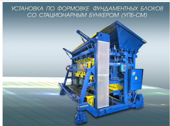
УСТАНОВКА ПО ФОРМОВКЕ ФУНДАМЕНТНЫХ БЛОКОВ СО СТАЦИОНАРНЫМ БУНКЕРОМ (УПБ-СМ)

Warranty period: up to 18 months from the date of the equipment shipment Delivery conditions – CPT or FCA («INCOTERMS 2010»)