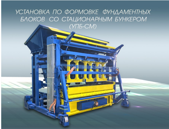
УСТАНОВКА ПО ФОРМОВКЕ ФУНДАМЕНТНЫХ БЛОКОВ СО СТАЦИОНАРНЫМ БУНКЕРОМ (УПБ-СМ)

Equipment does not require commissioning works!