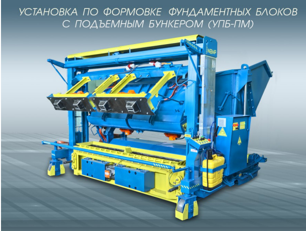
Equipment does not require commissioning works!