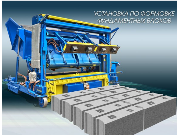
УСТАНОВКА ПО ФОРМОВКЕ ФУНДАМЕНТНЫХ БЛОКОВ

Equipment does not require commissioning works!